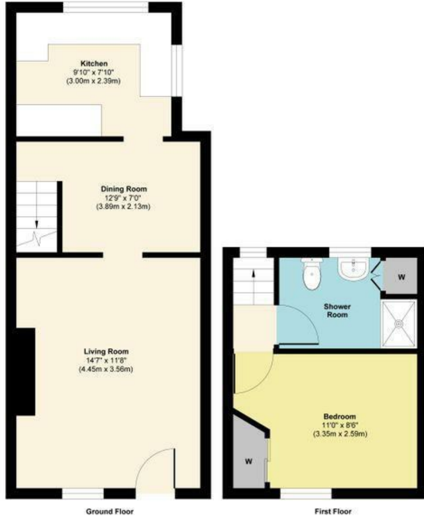
Illustration for identification purposes only, measurements are approximate, not to scale. Produced by Elandells Property