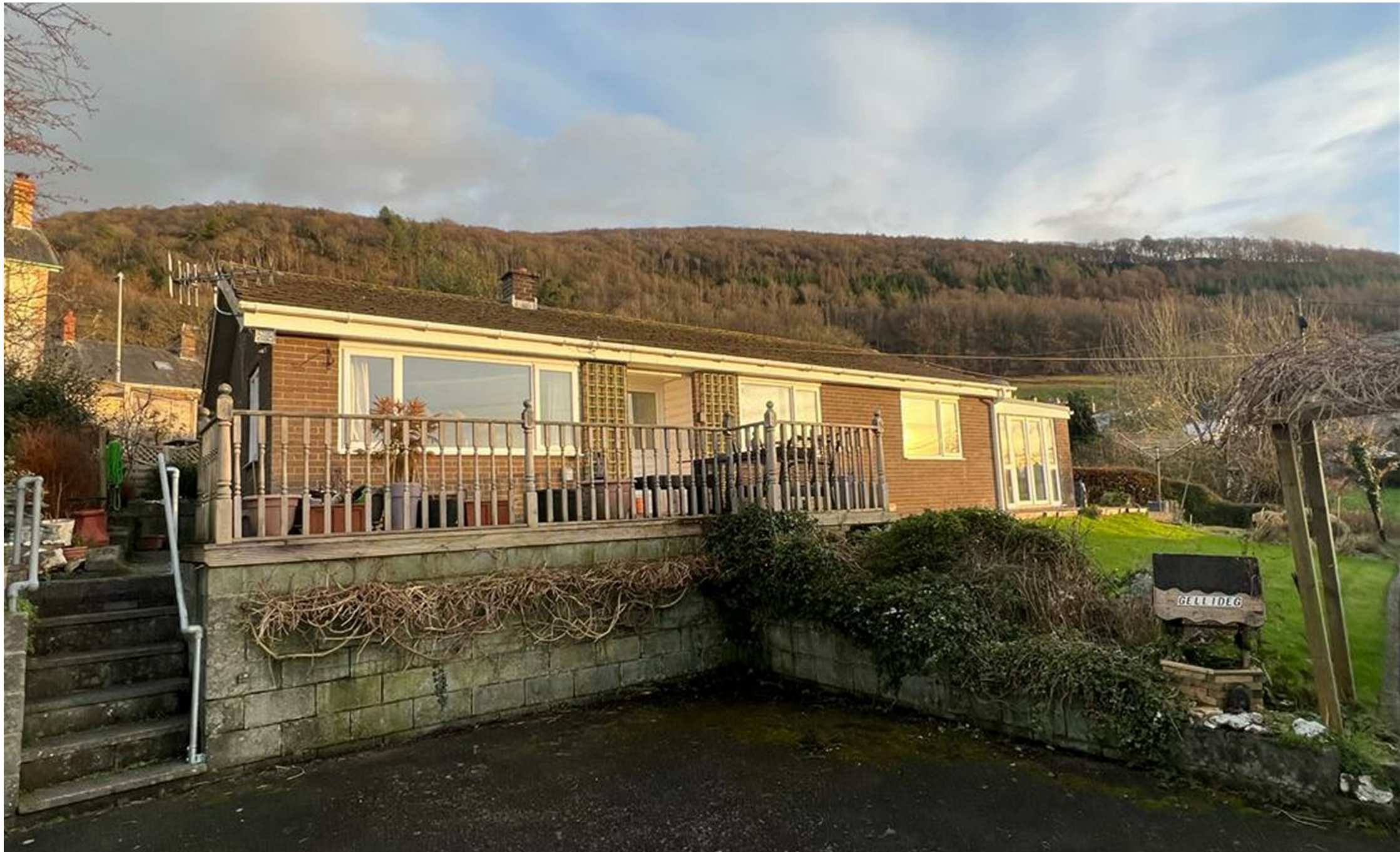
Gelli Deg , Taliesin Machynlleth Powys SY20 8JH Guide price £195,000