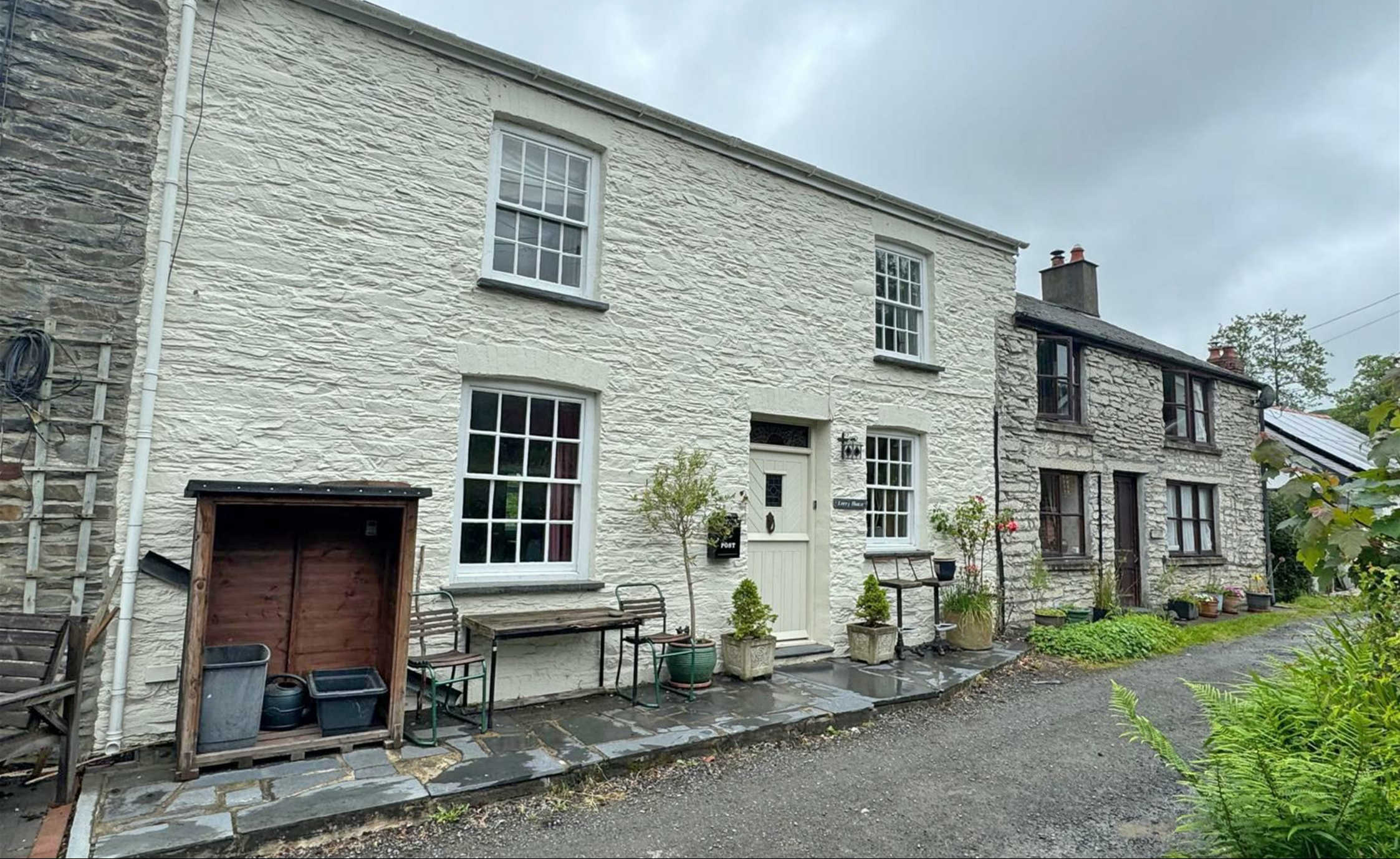
Lerry House , Talybont Aberystwyth Ceredigion SY24 5ED Guide price £295,000